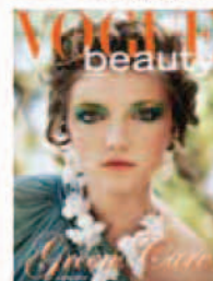
Clockwise from top left: Images from Italian Vogue Beauty , February 2009; 2007; Telegraph Magazine , March 2008; Italian Vogue Beauty , June 2007; February 2009; May 2009; April 2005. Here: covers from French Playboy , June/July, 2009; Italian Vogue Beauty , April 2005; June 2006