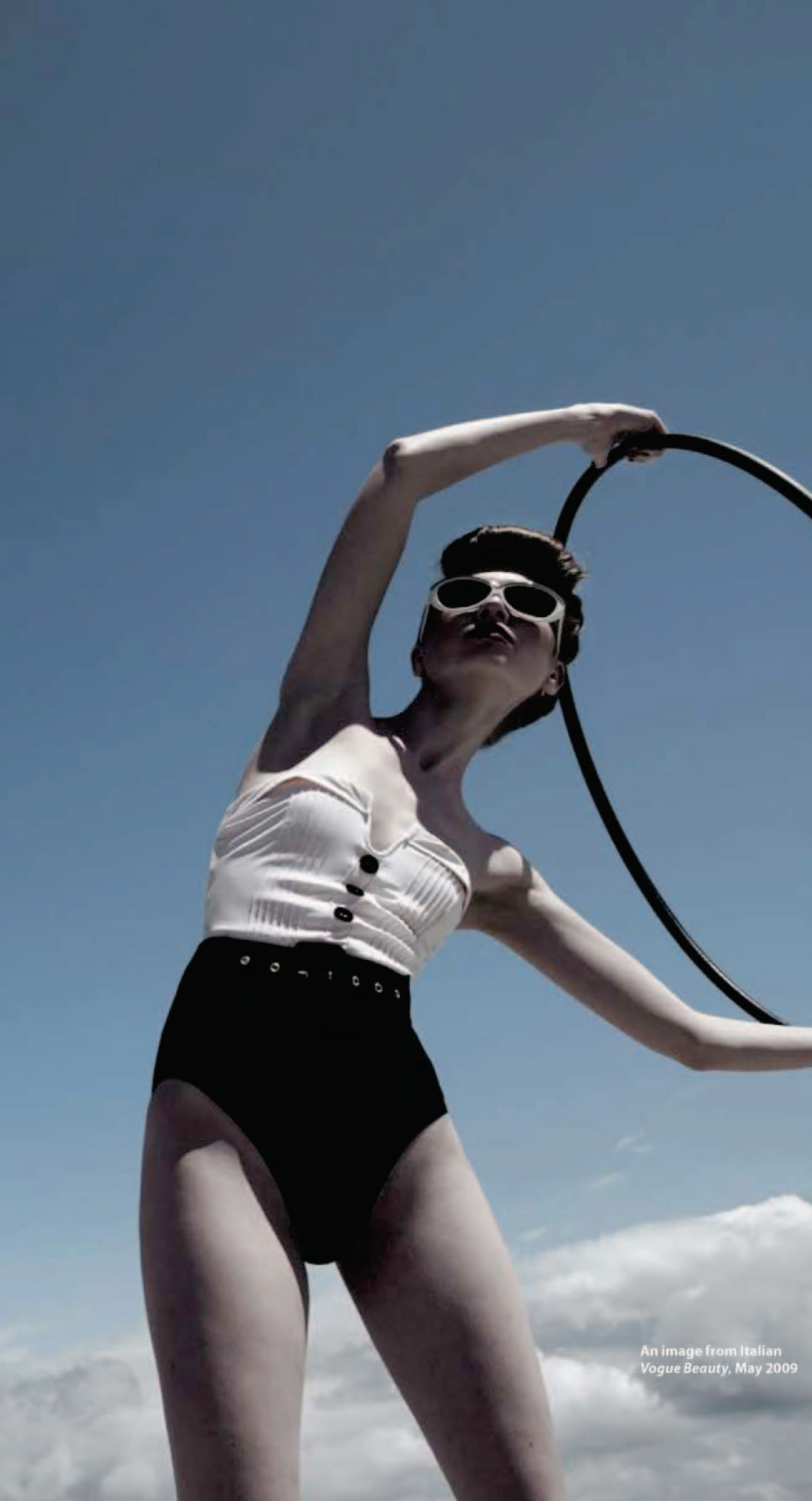
An image from Italian Vogue Beauty , May 2009